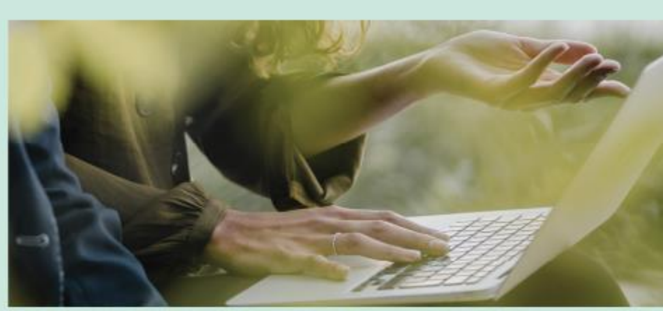
Interim report 1 January - 30 September 2023