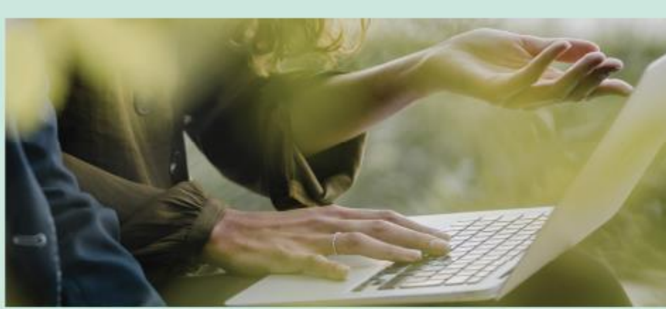
Half-year Report 1 January - 30 June 2023